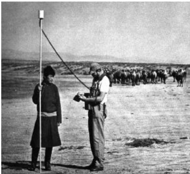
G-856AX Desert Survey in Tibet

A thoroughly well proven design (over 2,000 units sold), excellent performance and the lowest price professional system are key features of the G-856AX. Combined with the ease of use, user friendly download/editing software, and readily available commercial contouring programs, the G-856AX represents a complete magnetic surveying package generating high quality data for budget conscious users.