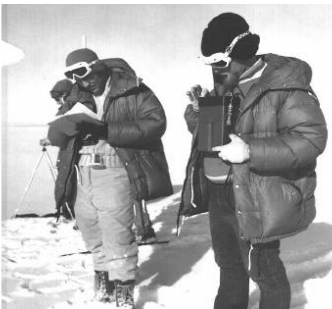
G-856AX Arctic Survey

The automated cycling option with long sensor cable and external power connection allows use of the G-856AX as a Basestation unit for the measurement of diurnal changes in the earth's magnetic field. Diurnal correction data is then downloaded by MagMap96 and can be applied to other 856, 858 or Airborne data.