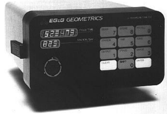
G-856AX Electronic/Battery Console

The G-856 provides a reliable, low cost solution for a variety of magnetic search and mapping applications. Single key stroke operation means the G-856AX can be operated by non-technical field personnel or used in teaching environments. The G-856AX uses the established proton precession method, allowing accurate measurements to be made with virtually no dependence upon variables such as sensor orientation, temperature, or location. The