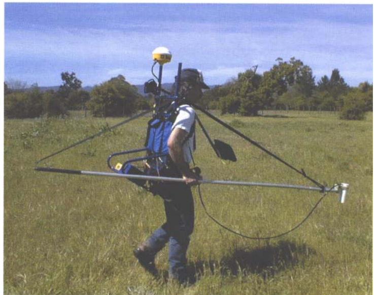
Combined G-858 and ag114 GPS Survey System